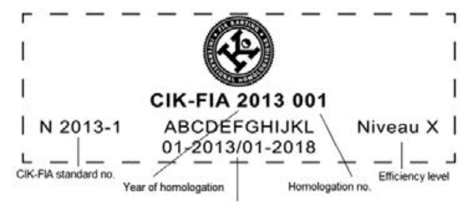
Manufacturer, manufacture date and homologation expiry date

Please remember that for short-circuit kart overalls in the UK, any expiration date shown on the CIK-FIA homologation label is not relevant. (U)13.4.1. requires the overalls to be one of the two latest CIK-FIA standards, either N 2001-1 or N 2013-1 and either Level 1 or 2. As you can see in the example label for the N 2013-1 here, there is an expiry date quoted and we have had some reports of drivers being turned away at scrutineering because this date has passed. This should not be the case, provided that the overalls remain in acceptable condition, then they should be accepted.